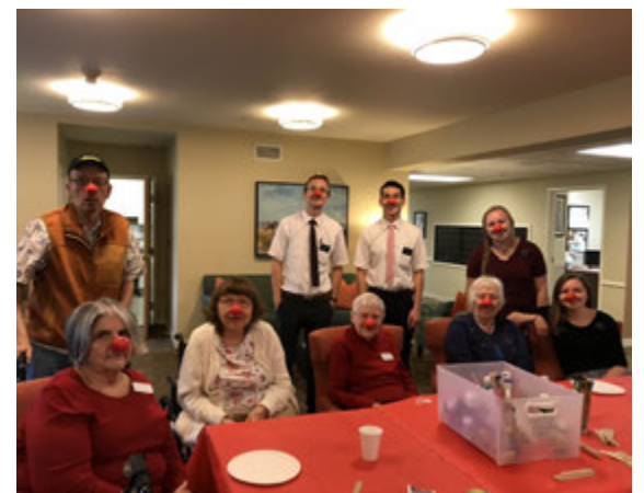
Craft Group joined in on the fun as well!