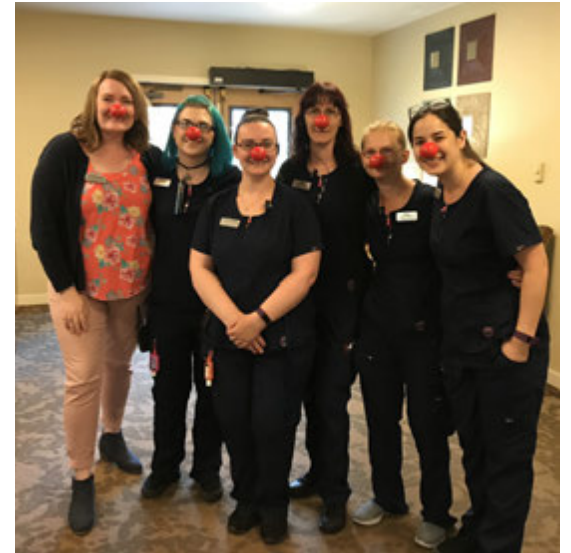
Our fabulous Health and Wellness staff all gathered together!

Celebrated nationally, National Red Nose Day on Thursday, May 24, was a smashing hit at Canfield Place. Residents and staff celebrated in style donning their red noses throughout the day. Whether it was during exercise class, a meal or craft group, both employees and residents showed their support by donating to this honorable foundation. Red Nose Day is a fundraising campaign run by the non-profit organization Comic Relief, Inc., and brings people together to have fun, raise money and change the lives of kids who need help the most. Red Nose Day launched in the U.S. in 2015, dedicated to ending child poverty, both in the U.S. and in some of the poorest communities in the world. The money raised by Red Nose Day in the U.S. has benefited programs for children and young people in all 50 states and in 34 countries internationally. Globally, Red Nose Day has raised over $1 billion since its launch in the U.K. in 1988. We appreciate all the support Canfield Place showed for this special day!