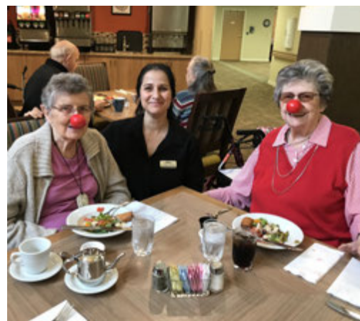
Enjoying a Red Nose Day-themed lunch!