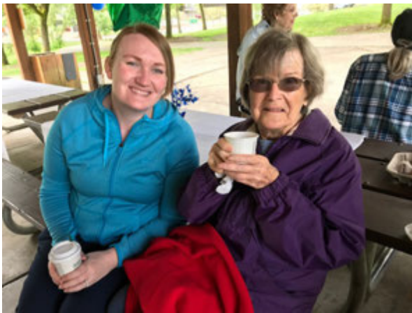
Employees and residents warming up before the race!