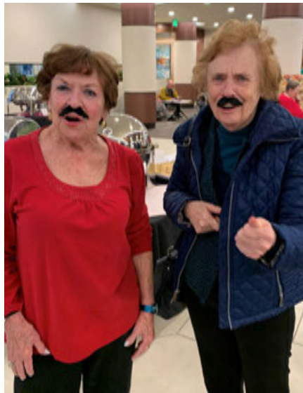
Some residents embraced the French theme more than others!