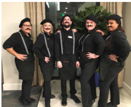
The Front of the House really embraced our French theme!