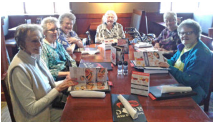
Dinner out at Red Lobster