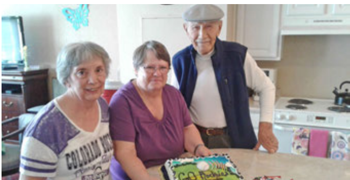
Celebrating the Rockies Home Opener