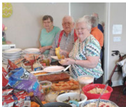
Rockies Hot Dog BBQ