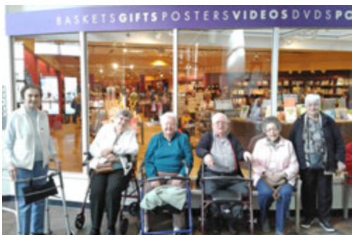
The Denver Museum IMAX