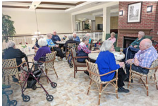
Happy Hour Happenings