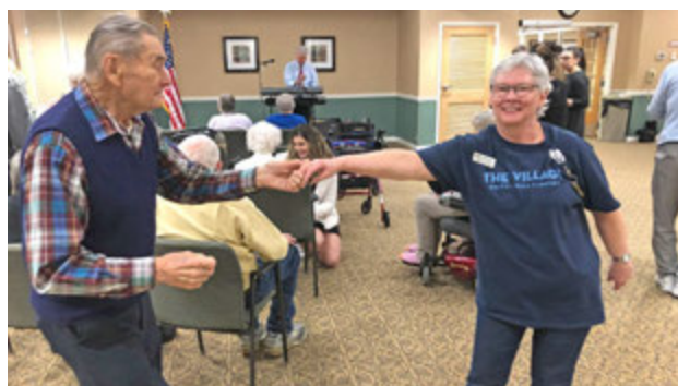
The Village at Unity hosted our annual Senior to Senior Dance with students from Spencerport High School!