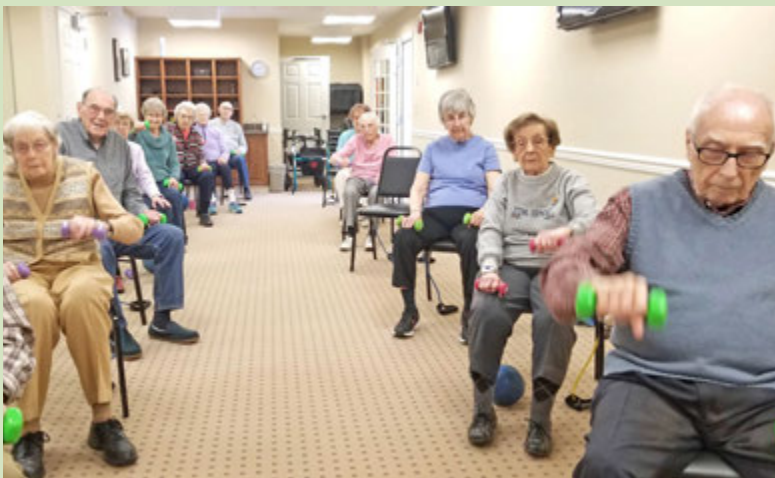
PrimeFit Exercise Class meets every Tuesday to Friday.

This was our first year participating in the February Fitness Frenzy, the one month dedicated to being active and raising money based on how active we are. I hope that you all enjoyed being a little more active than usual and that when you logged your activity, you might have been a little surprised at what you can do. We had 70 participants tracking their activity and we moved for over 103,365 minutes. That is an average of over 52 minutes a day per person. Way to go! We raised a total of $800 that will be donated to a charity that helps women and children. Thank you to all who participated.