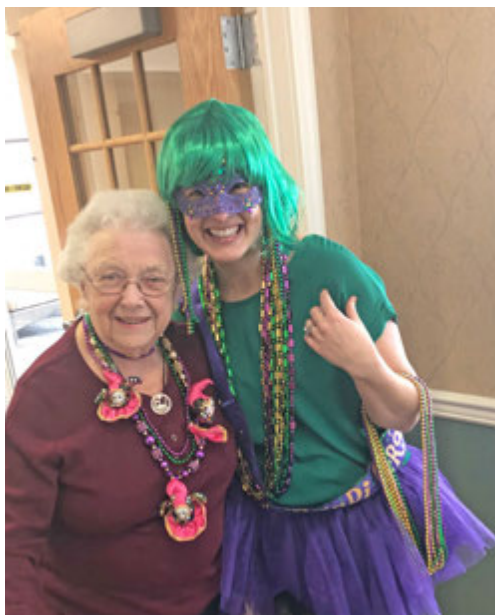
Mardi Gras fun!