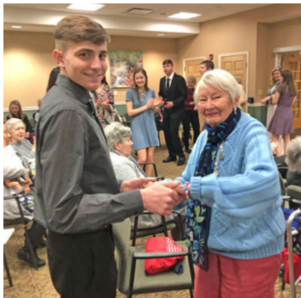
Senior to Senior Dance!