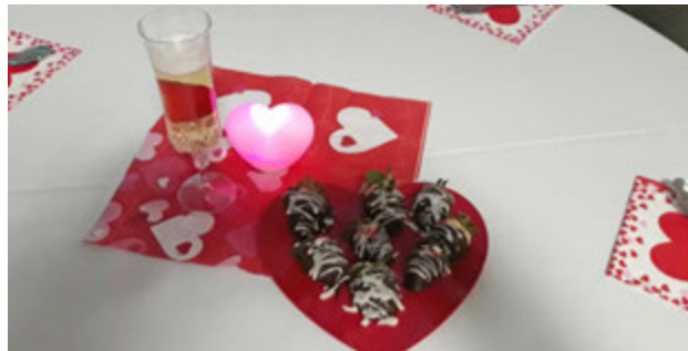
Valentine's Day "Love Is In The Air" Music Social!