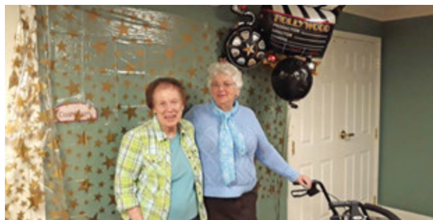
And the Oscar goes to ...