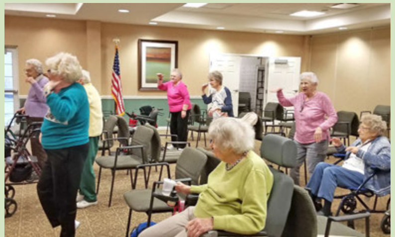
Strutting their stuff during the walker dance lesson.